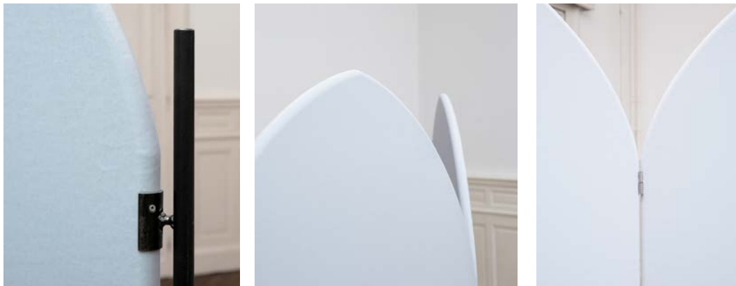
An army of me, Correspondance L/F 3 panels of wood covered with Harald 2 by Kvadrat Raf Simons 722, 2 metal legs, inox hinges, aluminium plates. 180 x 360 x 100cm, 2016.

WE FACE AN ARMY – BUT AN INOFFENSIVE ONE, HELPLESS AND HEAVY, ICE CREAM COLOURED. THE PALE BLUE VELVET SURFACE WHITENS WHILE EXPOSED AT THE DAYLIGHT – NOTHING ELSE WILL HAPPEN. «THERE IS NO OTHER PLACE, NO ONE ELSE TO FACE.» THE ICY BABY BLUE COLOUR ACTS ON YOU LIKE A SHARP COLD BLADE.